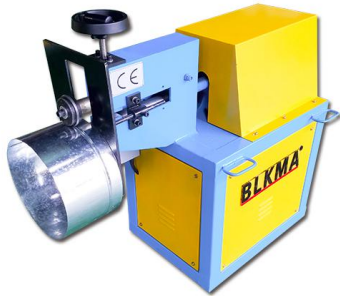
Round Duct Grooving Machine